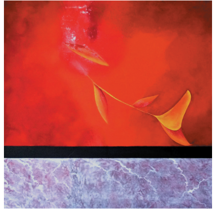
Rosso n. 54